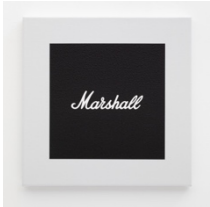
Juan Bolivar Marshall Acrylic on canvas 36 x 36 cm 2017 £1200