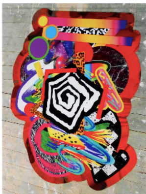
Nicky Carvell Hexel Facade Printed mat £550