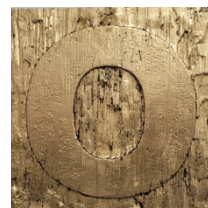
Mark Titchner A Study of O (Gold) Carved, burnt wood and imitation gold leaf 40 x 40 cm 2014 £3500