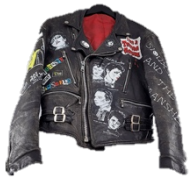
Sue Webster The Helter Skelter Jacket Hand painted leather jacket 74 x 54 cm 2019 NFS