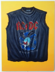
Tom Cardwell AC/DC Oil on linen 80 x 61 cm 2018 £2000