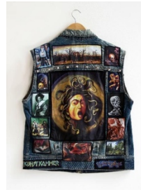
Tom Cardwell Kunstkammer II Custom printed patches on denim jacket 2018 £1500