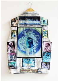
Tom Cardwell Kunstkammer II (Burnout) Custom printed patches on denim jacket 2018 £1500

GUEST CURATORS: Tom Cardwell & Juan Bolivar 14 December – 22 December 2023