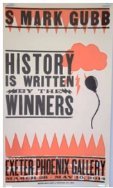
S Mark Gubb History is Written by the Winners Hatch show print 34 x 57cm Edition of 50 (signed) £30