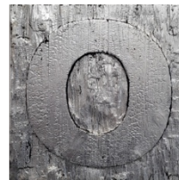
Mark Titchner A Study of O (Silver) Carved, burnt wood and aluminium leaf 40 x 40 cm 2014 £3500