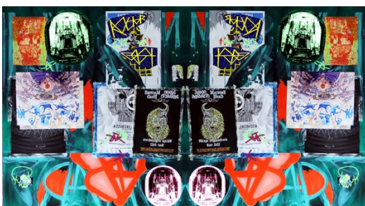
Tom Cardwell Vikings and Lionhearts (left) Kulturgeist 5 (right, draped) Digital print on fabric 340 x 190 cm each 2023 £1500