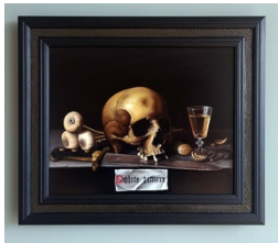
John Stark Nolite Timere Oil on wood 50 x 40 cm 2022 £6000