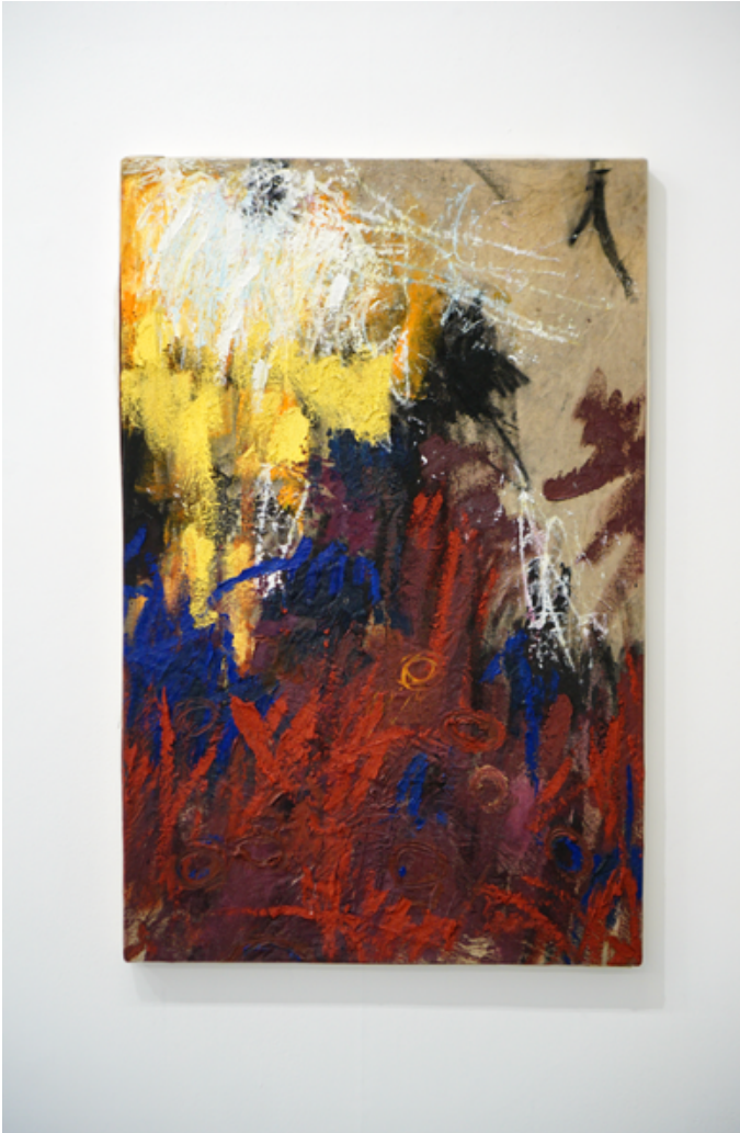
Potato patch (2023).

Oil on canvas, 61.5 x 94 cm. PRICE: £750