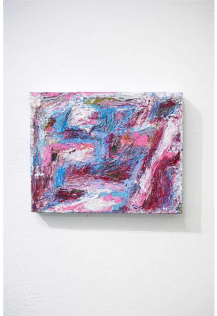
The air kept swirling after you left (2023). Acrylic, oil pastel and oil paint on wood, 15 x 12.5 cm. PRICE:£500