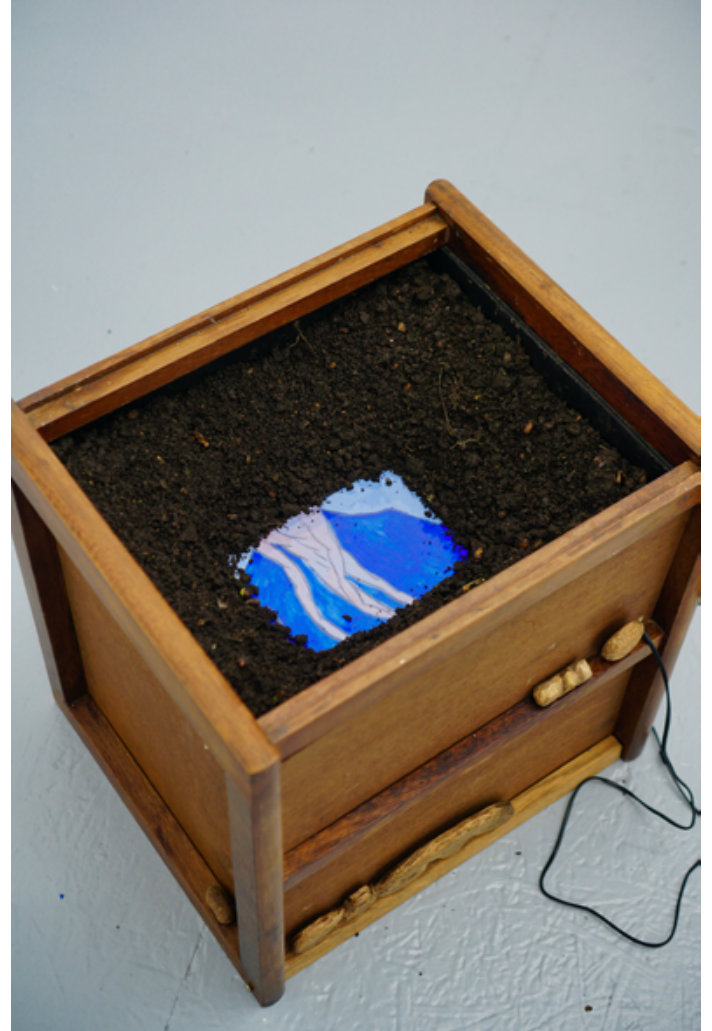
It's hard to move (2023). Stop motion made with oil paint and charcoal on paper, presented in a wooden box with wood carvings. Individual frames 14.8 x 21 cm. PRICE: £50 per frame View frames: https://bit.ly/hard-to-move