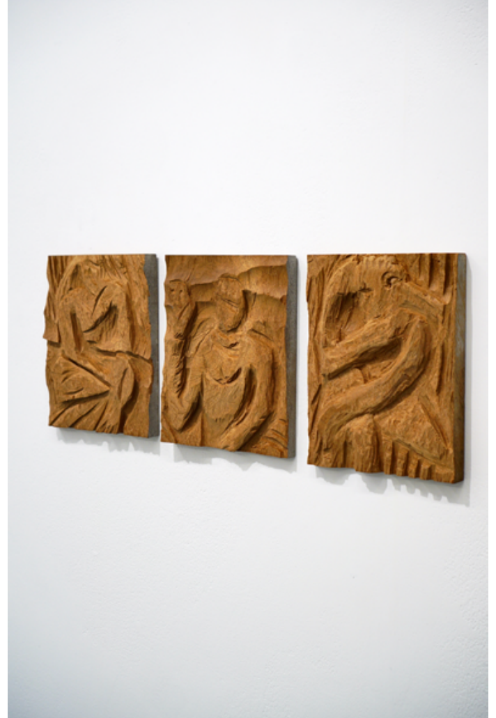
The Abject Mirror (tryptich) (2023). Three panels of carved hard wood, 50x20cm, each approximately 16 x 20 cm. PRICE: £1850