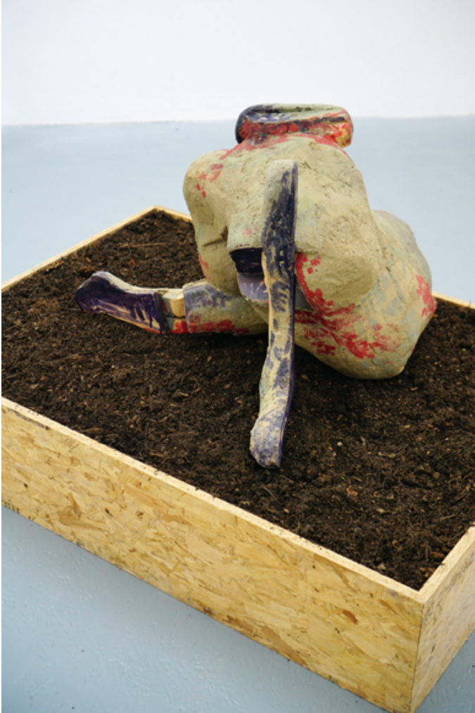
Clod (2014). Wood, plywood, steel, mesh, scrim, cement, paint, 53 x 62 x 70 cm. PRICE: £1800