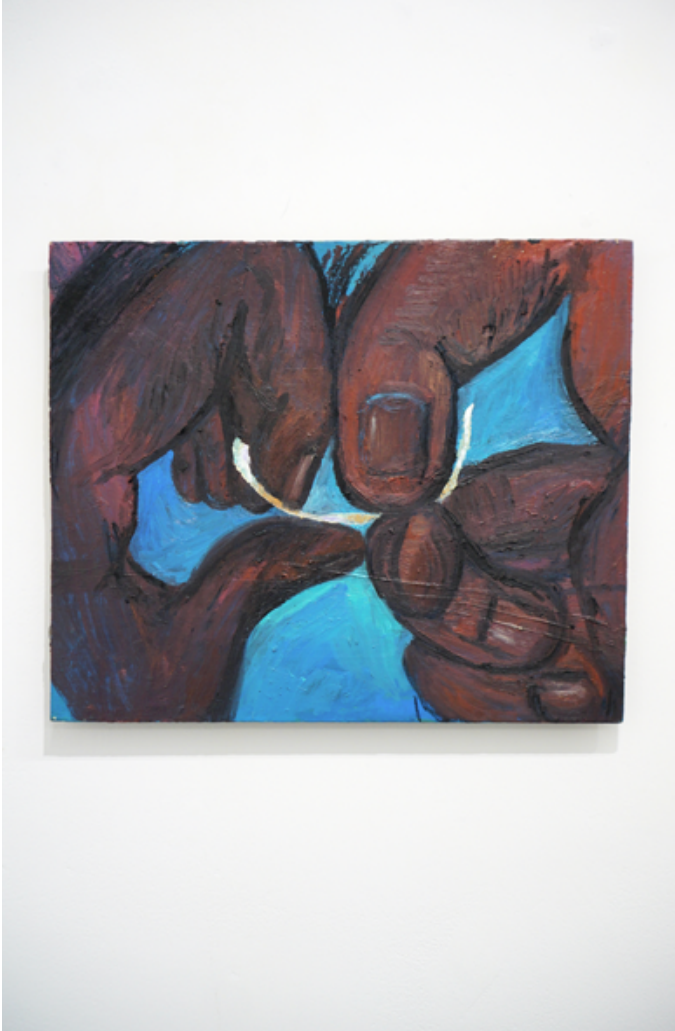
Picking (2022). Oil paint and charcoal on wood, 40x48cm. PRICE: £650