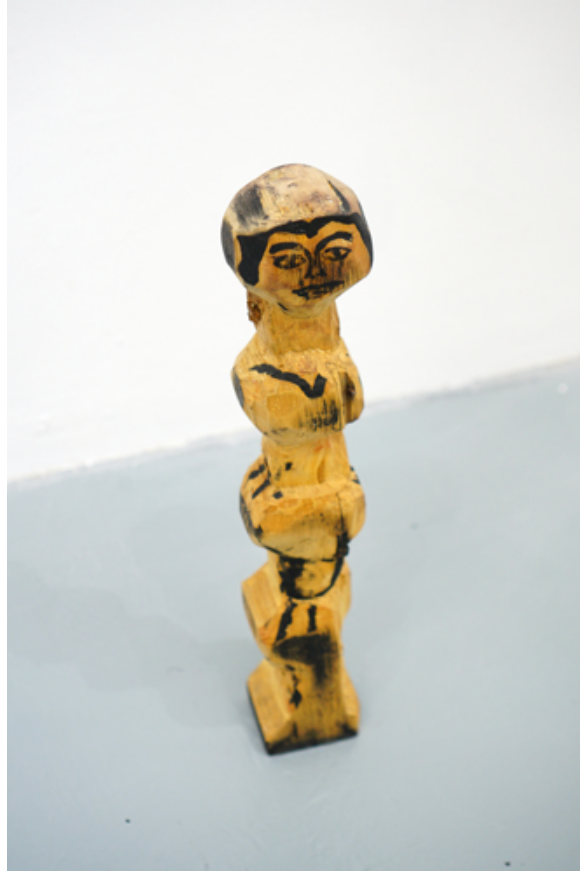
Gargantua's little stool (2022). Repurposed wood, wood stain, paint, 20 x 39 x 23 cm. PRICE: £950