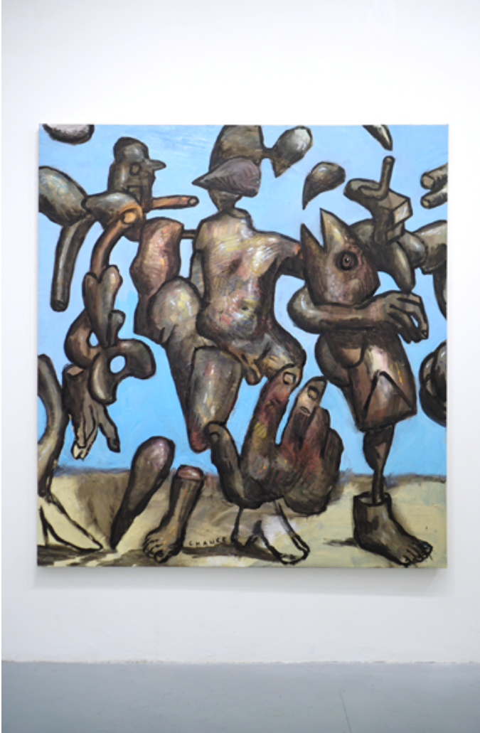
The Hunt (2023). Oil on canvas, 153 x 163 cm. PRICE: £4200