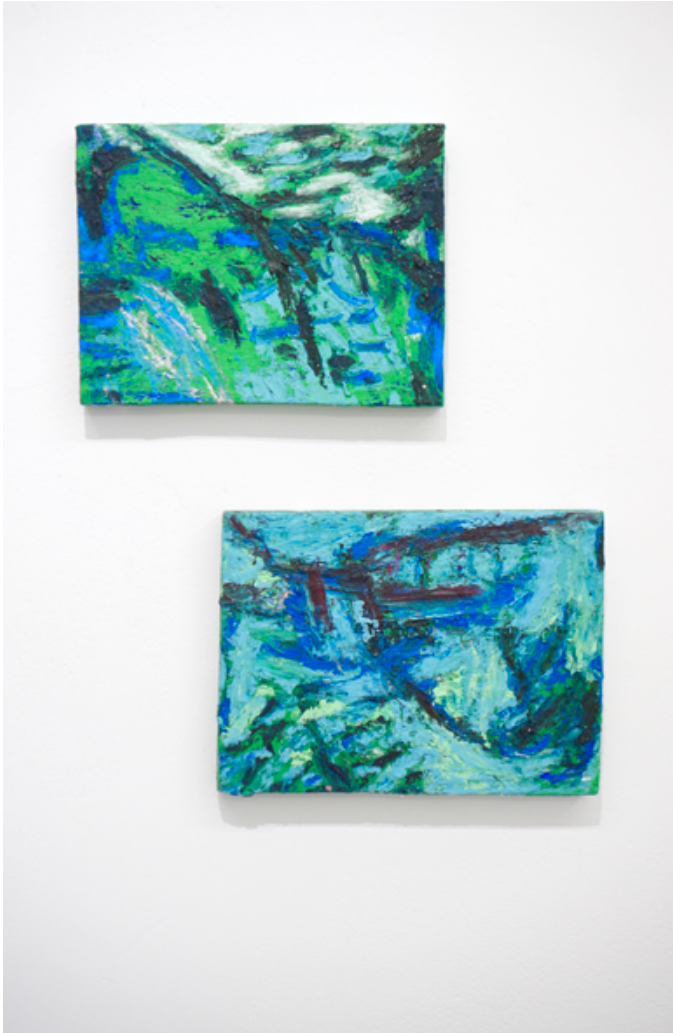
Green screen (2023). Acrylic, oil pastel and oil paint on wood, 19 x 15 cm. PRICE:£480