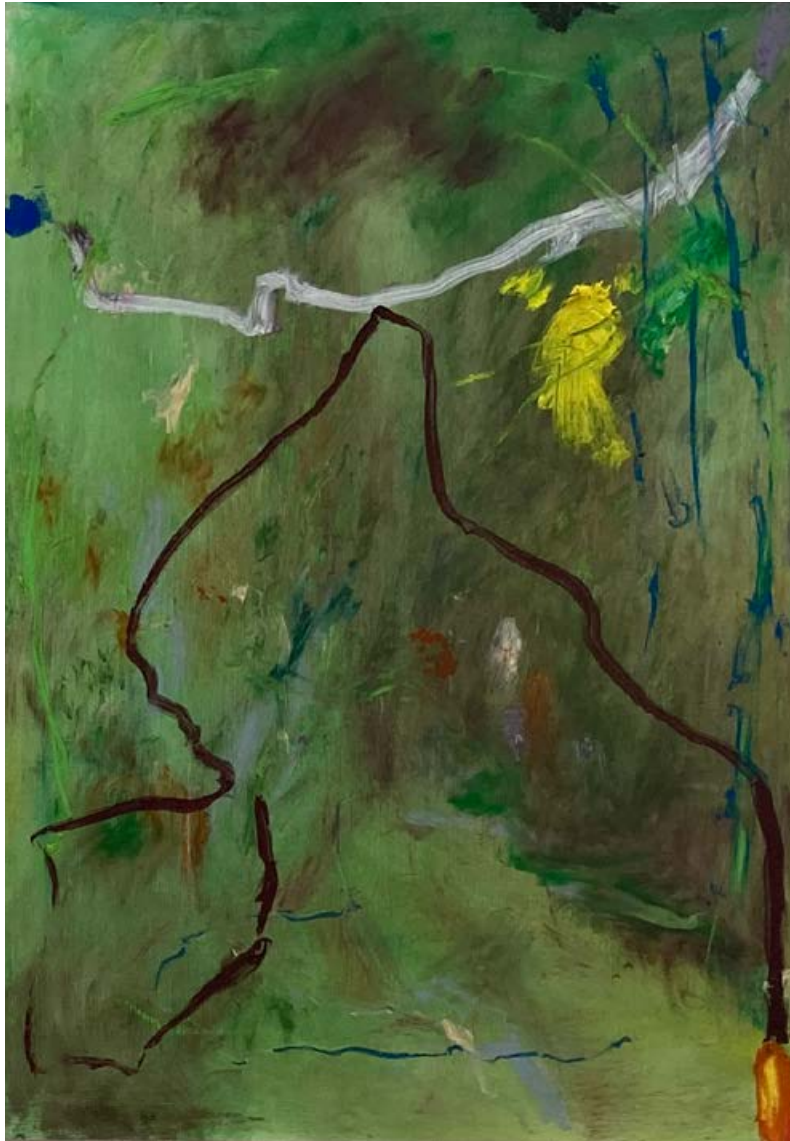
WATTEAU'S HARLEQUIN 19