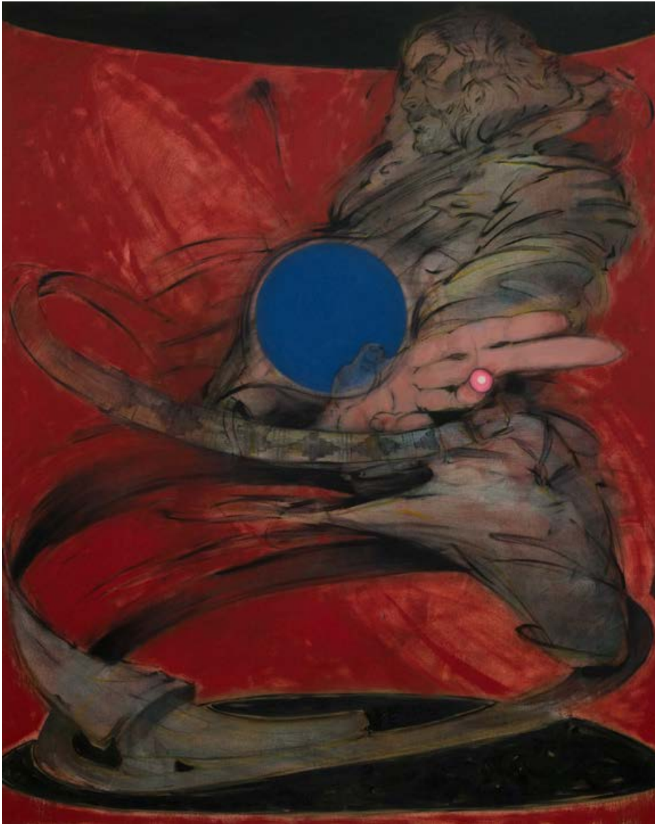
A MEDITATION ON TIME