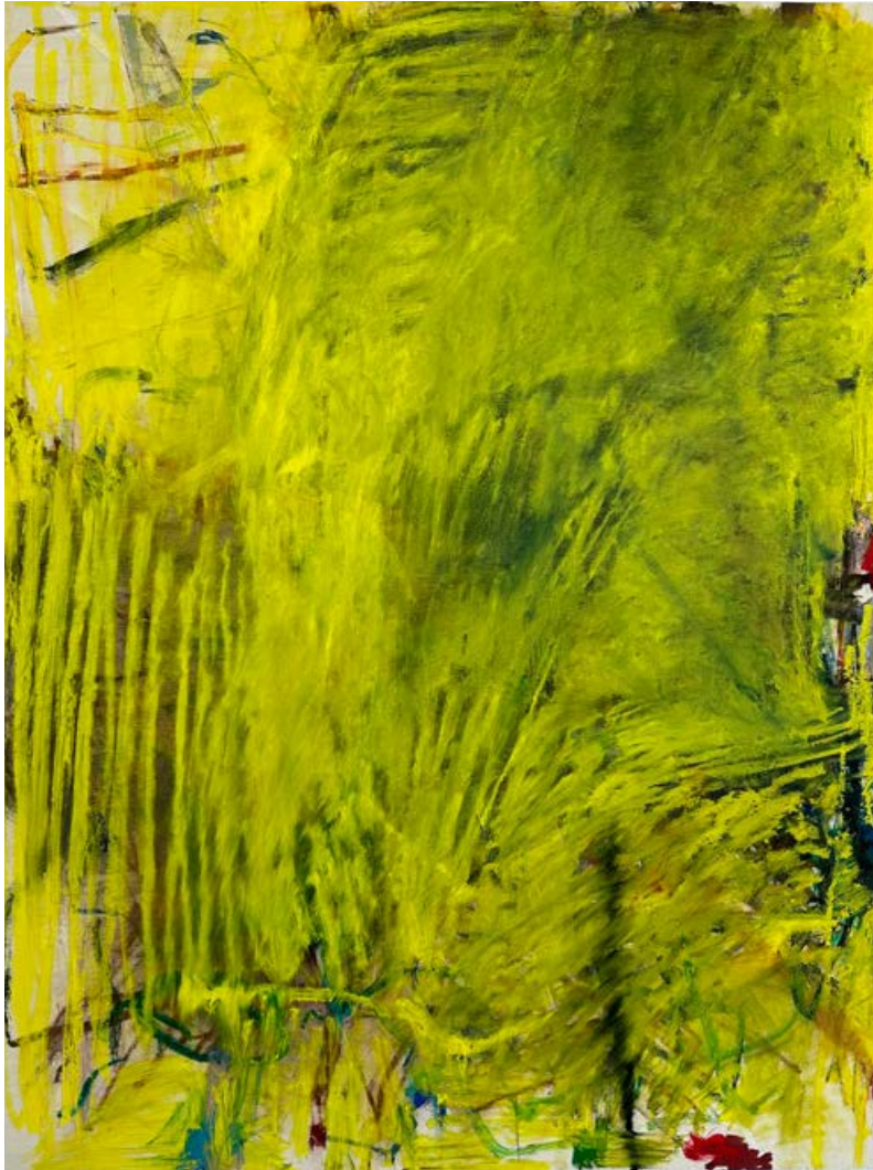
WATTEAU'S HARLEQUIN 1B