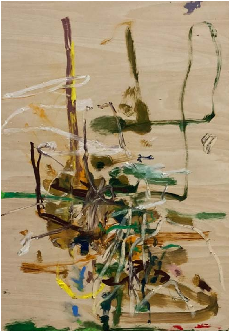
WATTEAU'S HARLEQUIN 10