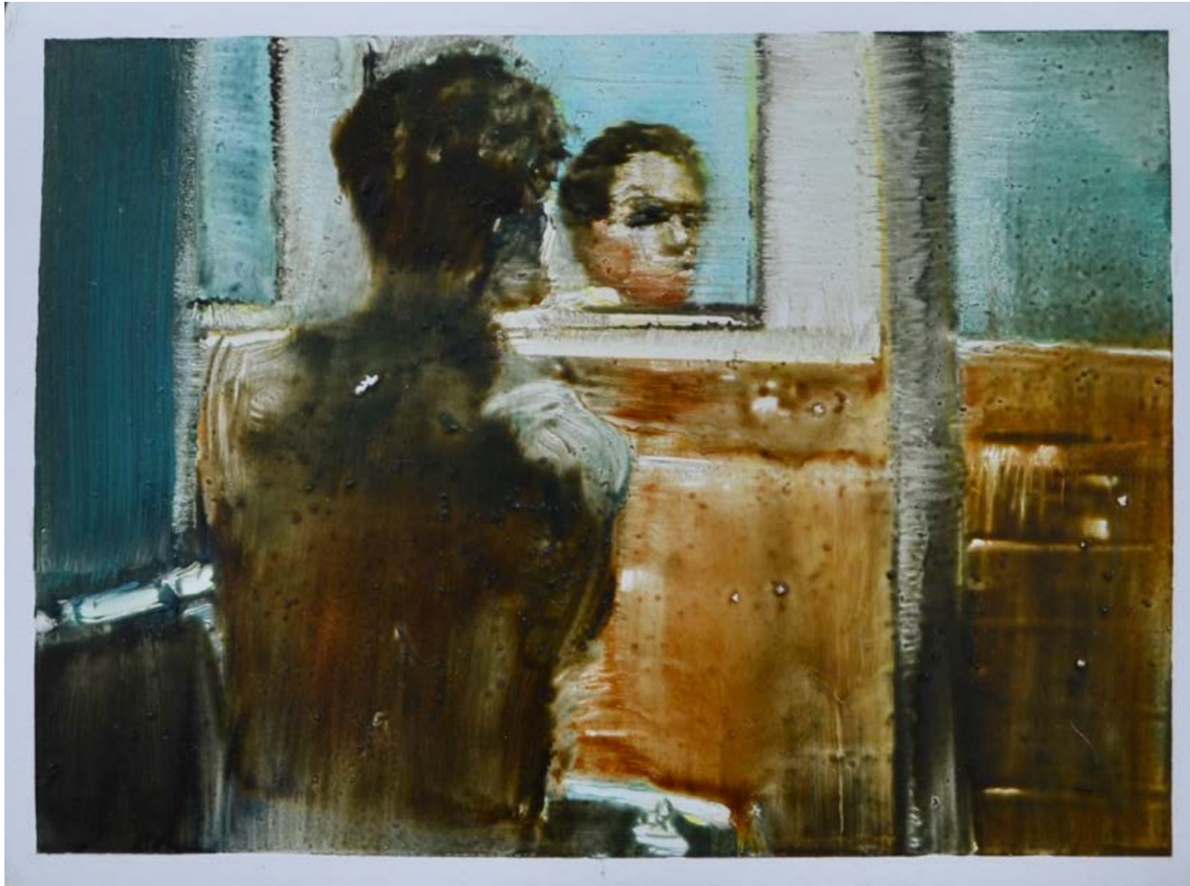
APRÈS LE BAIN, HOMME SE RASANT (AFTER THE BATH, MAN SHAVING)