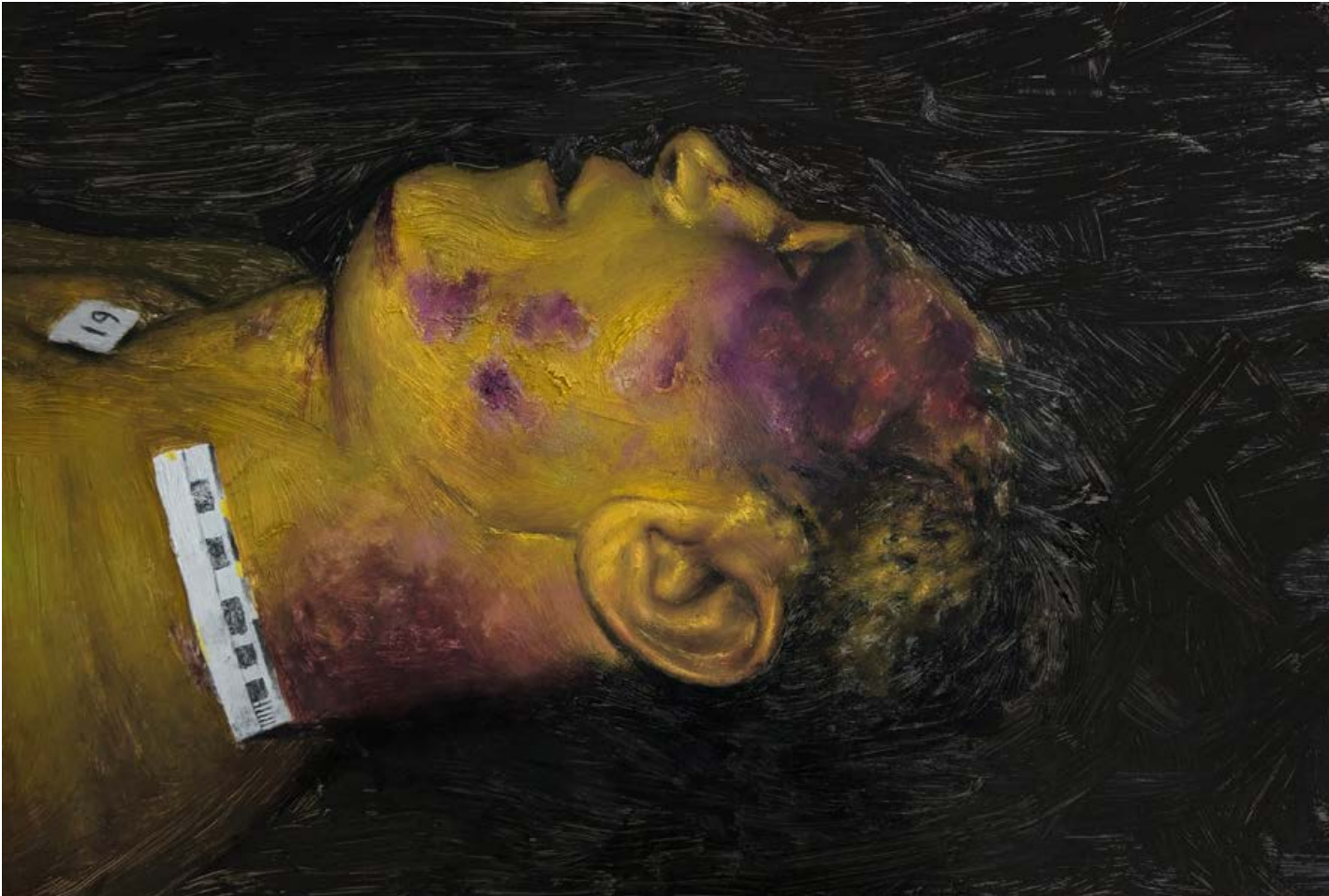
NAKED ISLAND 61