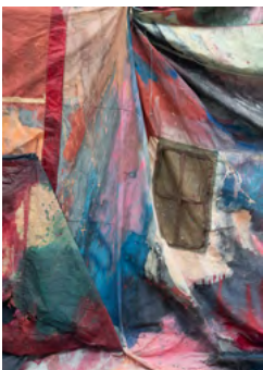
Home Front , 2022. Oil, acrylic, household and spray paint on stretched Army surplus tent canvas, 300 x 310 x 120 cm.

CRISTIANO DI MARTINO (b.1989, Italy) lives and works in London. His works are strongly influenced by his Italian heritage, he witnessed a dark Christian obsession with death that has long been an everyday companion for many Neapolitans. He uses the iconographic symbols that surrounded him as a signifier of sentiment: impressing upon them his own shifting outlook on the natural world and the transience of our human condition. These relics of his memory are melded with an elegance and material fragility to create isolated objects that seem to carry the weight of the world. Their essence – concealed or elaborately enshrined – shares something of the ideals of the past: of memories and how they become shrouded in personal sentiment. Cristiano trained at the Academy of Fine Arts in Florence, he has exhibited nationally and internationally at The Centre of Research and Documentation for Contemporary Art (Arezzo), The Chapel of San Saverio (Naples) sponsored by the councils of Naples and the Campania region, and with the RSW in the Royal Academy Building (Edinburgh) and the Royal Institute at the Mall Galleries (London).