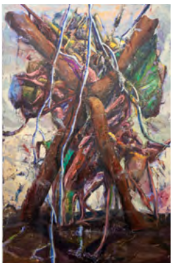
In A Field On The Outskirts Of A Nearby Town , 2022. Oil paint and soft pastel on canvas, 107 x 168 cm.