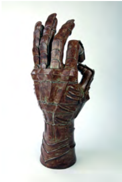
A-OK , 2020. Glazed stoneware, 18.6 x 50.7 x 16.7 cm.