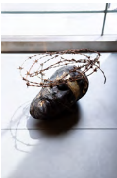
Head, 2022. Masking tape, newspaper and barbed wire, 40 x 40 x 25 cm.