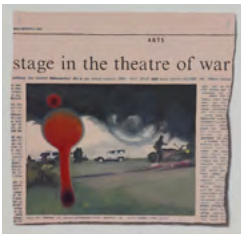
Theatre of War , 2003 - 07. Oil on linen, 45 x 35 cm.