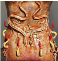
Palisade (detail) , 2022. Glazed Stoneware.