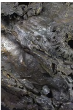
FALLEN No.2 , 2023. Bronze, 30 x 20 x 15 cm.