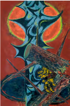
Snap , 2022. Oil on linen, 100 x 70 cm.