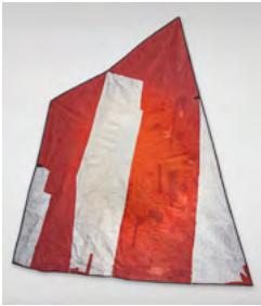
Untitled (Sloop) , 2018. Cement packets, cotton, 300 x 240 cm.