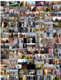
This is How We Win Wars (details), 2022. 6 minute film.