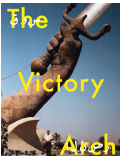
The Victory Arch , 2022. 15 minute film.

MIROSLAV POMICHAL (b.1984, Slovakia) lives and works in London and Sherborne, Dorset, where he teaches art history. Miroslav's work is distinguished by a sculptural treatment of the picture plane. His paintings depict emblematic symbols, landscape, urban vignettes, and scenes of conflict in which black lines crisscross the surface of each picture, allowing a sense of disruptive narrative. Abstraction is interspersed with the use of myopic symbolism, a trope of Expressionist painting concerned with the issues and tragedies of modern life, and particularly the tragedies of war. The monumentally concrete armature of the legacy of Expressionism is punctuated dramatically by a sense of dramatic storytelling and a commitment to the spiritual side of humankind as well. Miroslav has an MFA from Wimbledon College of Art and a BA in Art History from The Courtauld Institute of Art, London. His work is held in private and public collections, including the Ingram Collection. The artist has exhibited internationally at Kun Kelemen Fine Art, Bratislava; Flatgallery, Bratislava; Saatchi Gallery, London; Slate Projects, London; The Institute of Contemporary Arts, London, Bosse & Baum Gallery, London; The World Museum, Liverpool and The Leopold Museum, Vienna.