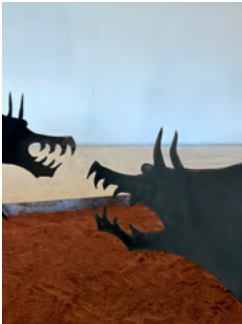
Two by Two , 2022. Steel, Casting Sand, Potassium Sulfide, Foam, Jesmonite, Ballast Sand, 127 x 96 x 88 cm.

SALVATORE PIONE (b.1995) lives and works between Sicily and London. Salvatore is influenced by the folklore and traditions of multicultural Sicily, Pione's practice is rooted in the personal and quaint - brushed with a grotesque theatricality. His exploration of land, persona, and movement come as a process of self-re-discovery concerned with the aesthetic language of memory. Transgressing the definitions between painting, sculpture, puppetry and animation; Pione's works often appear as all or none of these categoric mediums. Salvatore formerly studied 2D Animation at Centro Sperimentale di Cinematografia in Turin (2014), has a BA in Fine Arts at the University of Arts London (2021) and is currently undertaking an MFA at Goldsmiths University, London (2021-2024). His work has been exhibited internationally at Exante Studio, Sicily; Studio West Gallery, London; Hypha Studios, London; SET Woolwich, London; Enclave Projects, London; Collettivo Flock, Sicily; Archive Gallery, London; Southwark Park Galleries, London and Paratissima, Turin. He was selected for the 'Premio Arti Visive San Fedele 2023', a prize based in Milan, Italy.