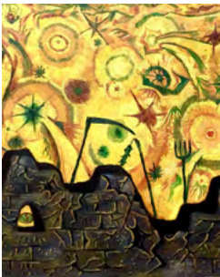
Peasants' Revolt 2 , 2022. Oil on canvas, 100 x 85 cm.

SALVATORE PIONE (b.1995) lives and works between Sicily and London. Salvatore is influenced by the folklore and traditions of multicultural Sicily, Pione's practice is rooted in the personal and quaint - brushed with a grotesque theatricality. His exploration of land, persona, and movement come as a process of self-re-discovery concerned with the aesthetic language of memory. Transgressing the definitions between painting, sculpture, puppetry and animation; Pione's works often appear as all or none of these categoric mediums. Salvatore formerly studied 2D Animation at Centro Sperimentale di Cinematografia in Turin (2014), has a BA in Fine Arts at the University of Arts London (2021) and is currently undertaking an MFA at Goldsmiths University, London (2021-2024). His work has been exhibited internationally at Exante Studio, Sicily; Studio West Gallery, London; Hypha Studios, London; SET Woolwich, London; Enclave Projects, London; Collettivo Flock, Sicily; Archive Gallery, London; Southwark Park Galleries, London and Paratissima, Turin. He was selected for the 'Premio Arti Visive San Fedele 2023', a prize based in Milan, Italy.