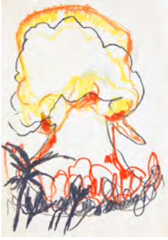
Now You See Me, 2012. Pastel on paper, 33 x 45cm.