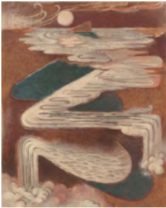
Telluric Symphony , 2022. Oil on canvas, 152.4 x 122.4 x 2.3 cm.