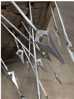
The Worm At The Core , 2022. Butchers block, steel, aluminium, resin, jesmonite, oil paint, wood stain, wax, spray paint.

MARTYN CROSS (b. 1975, UK) lives and works in Bristol. Martyn is primarily a painter engaged with 'world making.' The act of painting for him is a means to explore the inner life and strangeness of the ordinary. Each work begins in reality, with recognizable limbs and elements of landscape, which transform into uncanny scenes. Reoccurring motifs emerge — billowing clouds, tumbling waterfalls, oversized pointing fingers and bright suns create an immersive world. Biomorphic landscapes speak to mythologies, but in Cross's paintings the narratives are knowingly ambiguous. Familiar and mysterious, quiet and epic, scale and irregularity in proportion puzzles the viewer. Questions remain unanswered and meaning remains a mystery to the artist himself. Martyn holds a BA in Fine Art from Bath Spa University. Cross has exhibited nationally and internationally, including Hales London; Marianne Boesky, NY; Ratio 3, Los Angeles, CA; OSH Projects, London; Modern Art, London, UK; Oceans Apart, Manchester; Bath Spa University; Spike Island, Bristol; LIMBO, Margate; Stroud Museum, UK; Kettles Yard, Cambridge, among others. Cross' work is in the collections of the Institute of Contemporary Art, Miami and NN Contemporary Art, Northampton, UK.